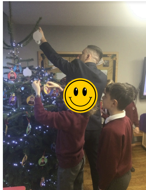
On Monday, we marked the start of advent by decorating our Christmas tree which was very kindly donated by our local Garden Centre.

We introduced our value of the month 'Hope' and discussed how the season is a time for hope as we remember the birth of Jesus, the light of the world.